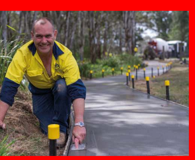
Work beginning on our dog walking track