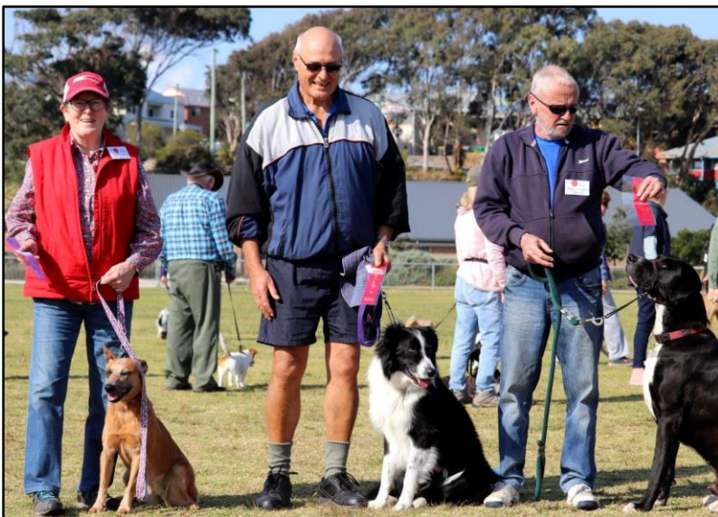
Red Class Rally O Winners