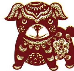
2018 Year of Dog