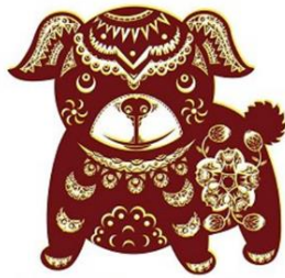
2018 Year of Dog