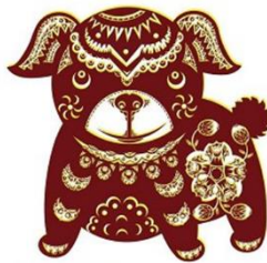
2018 Year of Dog