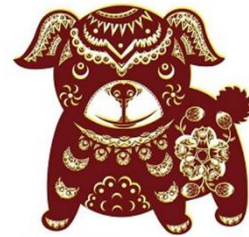
2018 Year of Dog