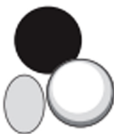
Circles, Ovals, & Spheres