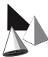
Triangles, Cones & Pyramids