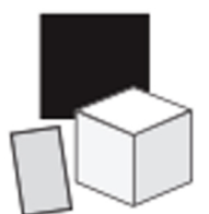
Squares, Rectangles & Cubes

Drawing an object begins with some basic shapes. Look around and you'll see them in everything.