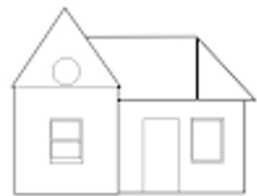
Use the shapes to draw anything, like this house.