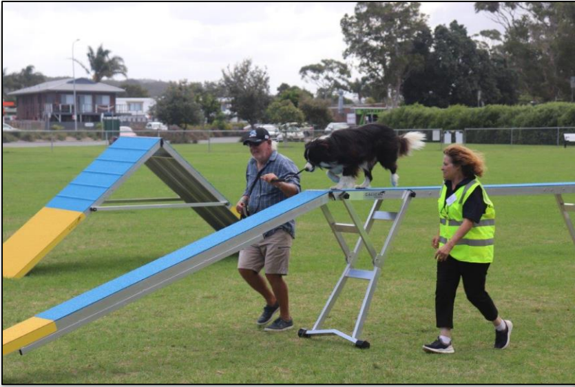
Bowie tried out the new Dog Walk (A Frame/Scramble in the background)