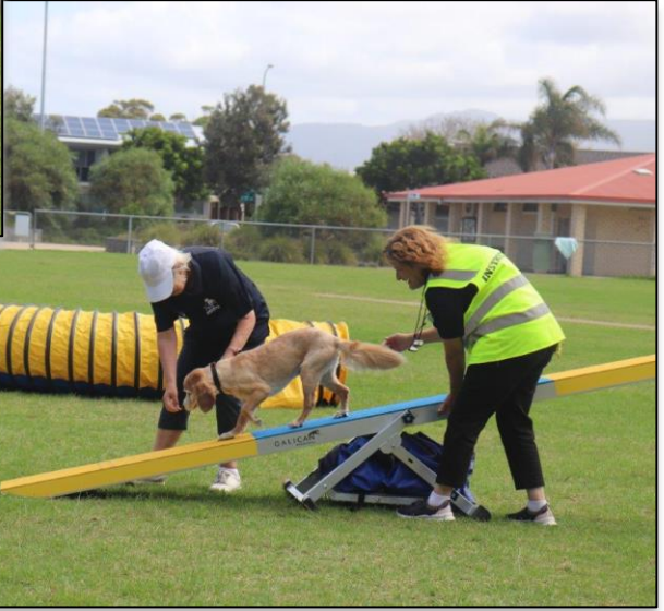
Shadow gets a refresher on the new See-Saw