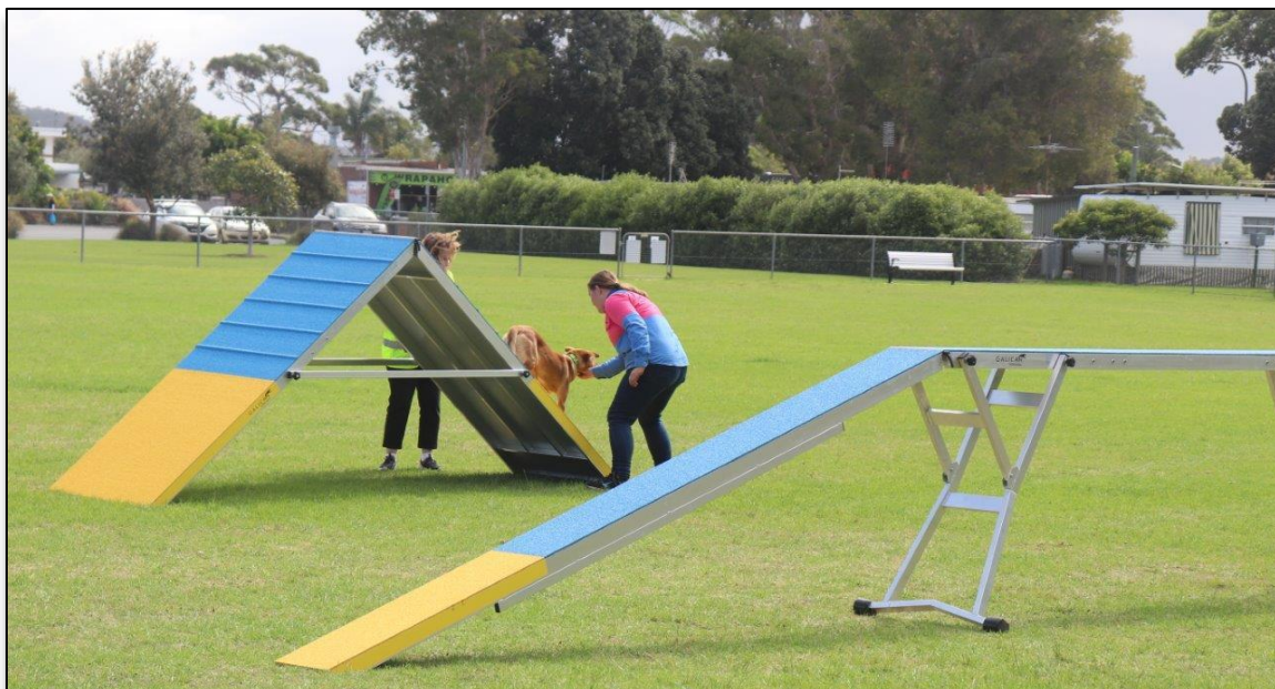
THE A FRAME/SCRAMBLE (behind) and DOG WALK (in front)