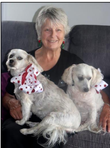
with Fifi and Chippy