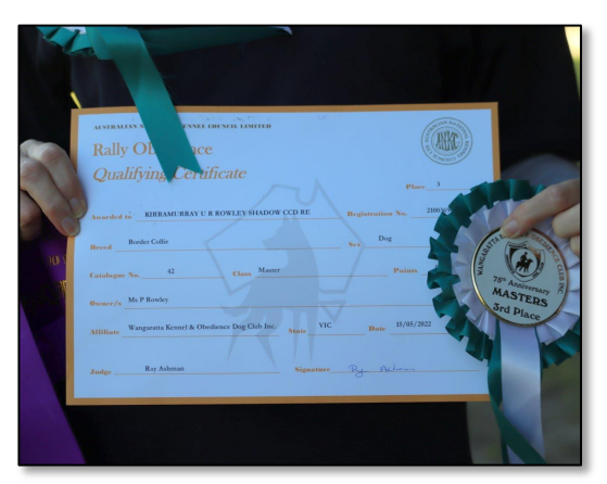
Rollo's Rally Masters Certificate

Pam Rowley Rally Obedience/Red Class Instructor