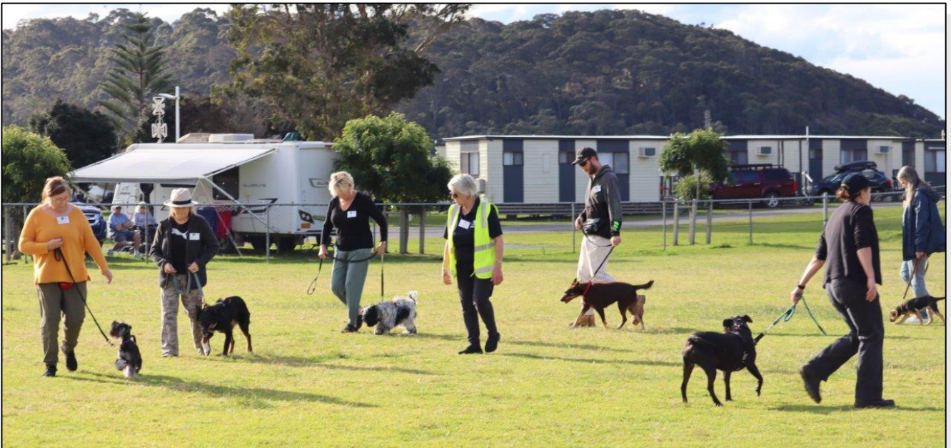
Learning basic obedience skills in Green Class and putting on a good show for the audience.