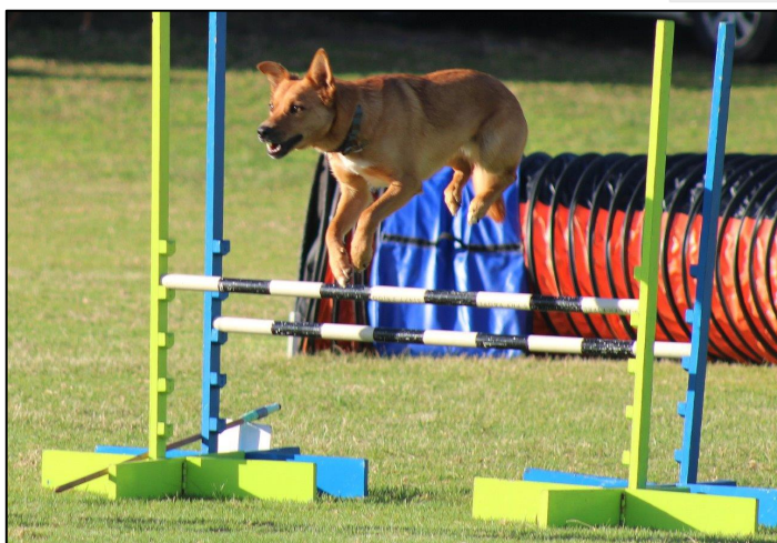
Kai just loves to jump! Look at those front paws tucked in.

And sometimes it is not such a good day for agility.