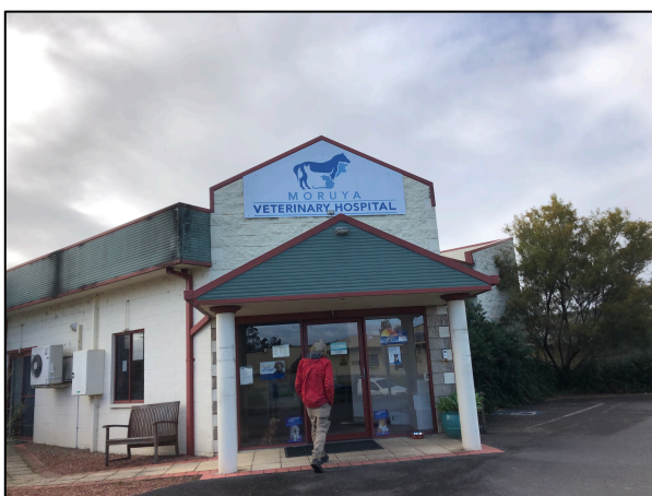
July 9 – Ella is admitted to Moruya Vet Hospital