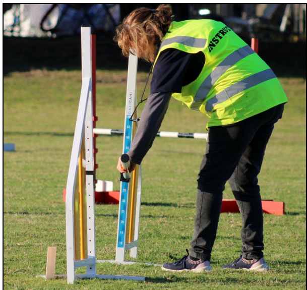
Setting up for Agility. Measuring the height and width of jumps.